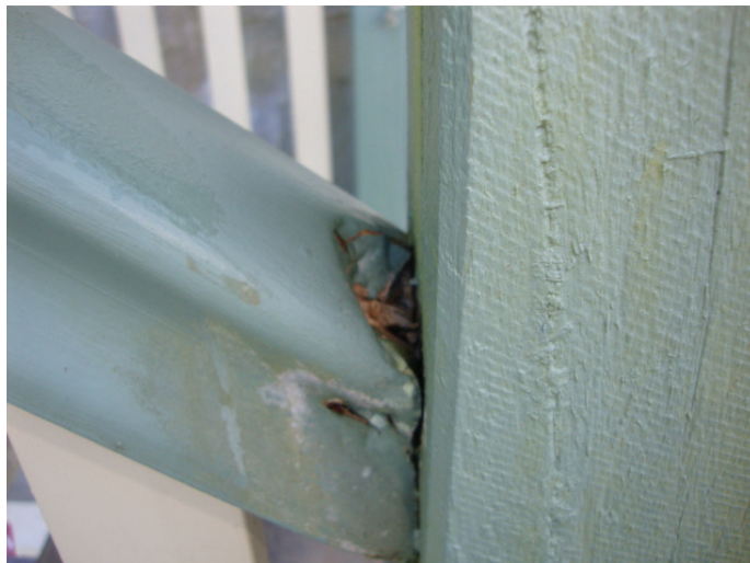
Photo 1: - Avoid premature failure by applying supplementary preservative and alkyd (oil) primers on all cuts, notches, holes etc

Timber Queensland and the Building Services Authority are experiencing increasing feedback and concerns from the building industry regarding the performance and premature failure of H3 Light Organic Solvent Preservative (LOSP) treated pine products due to decay. In many instances failure of these products has occurred under 5 years in-service. These products may include solid timber, laminated and finger jointed timber and LVL.