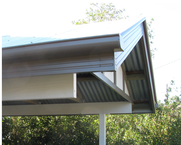
Photo 3: Adequate overhang and quality pale coloured paint system provide good protection to end grain and sun exposure

Apply 2 topcoats of either quality acrylic or solvent based paint to the prepared product.