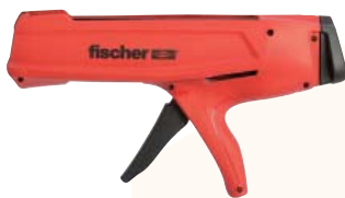
Dispenser FIS DM S