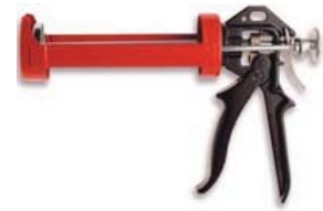
Cordless dispenser FIS AC