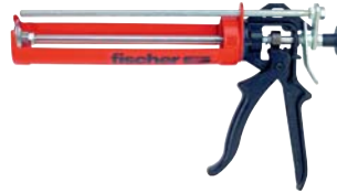
Dispenser FIS AM