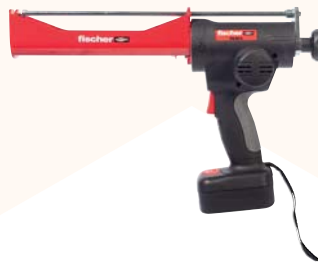
Cordless dispenser FIS DC S