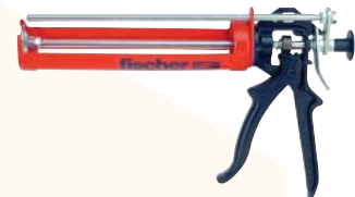
Dispenser FIS AM