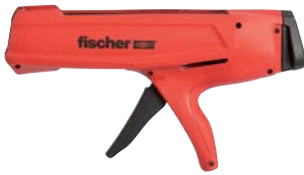
Dispenser FIS DM S