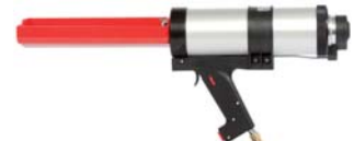
Dispenser FIS DP S-L