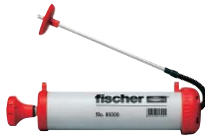
Blow-out pump ABG