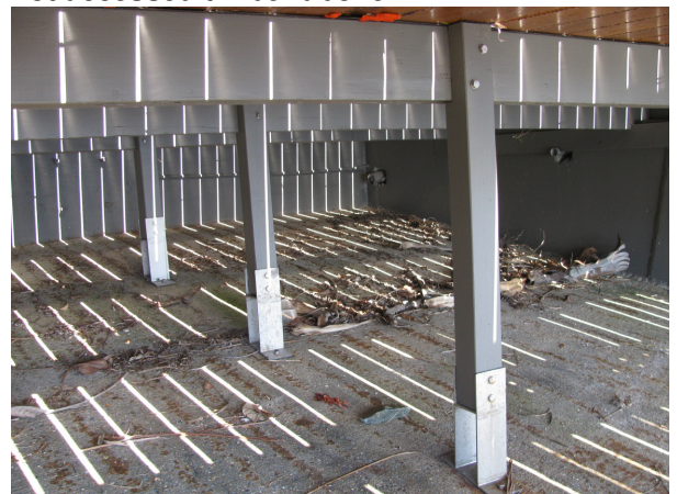
Check the base of posts to ensure termites have not accessed timber above.

Termite track ('mud tunnel') on post. Termites attacking timber deck above