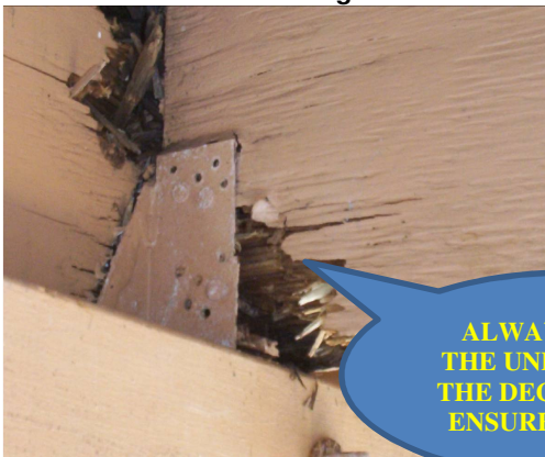
Decayed deck joist and fascia – deck should not be used as dangerous

ALWAYS CHECK THE UNDERSIDE OF THE DECK FIRST TO ENSURE IT IS SAFE