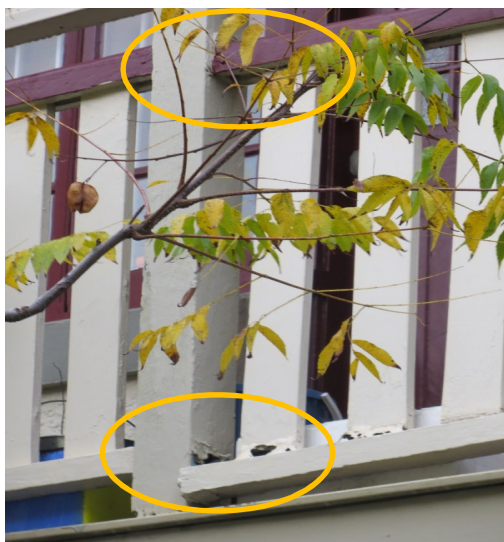
Unlike the above example make sure handrail and balustrade connections are secure