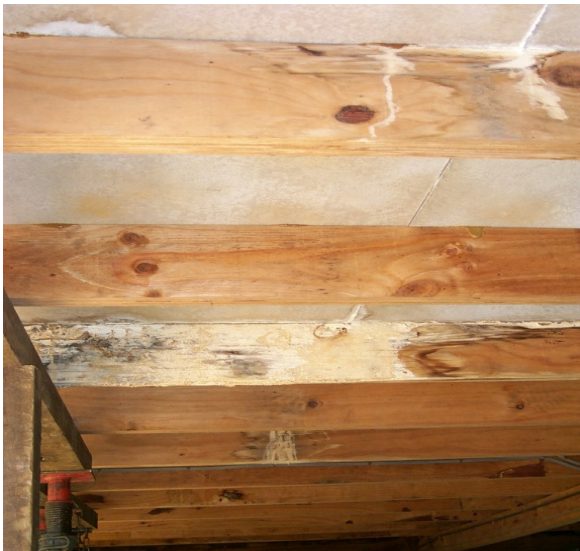
Decay in joists under a supposedly “waterproof” deck