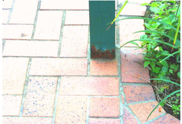
Severe corrosion in metal bracket supporting deck post