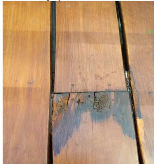
Check for decay at ends of decking boards. In this example, the board is not safe.