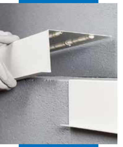
Flexible bonding of construction members and features