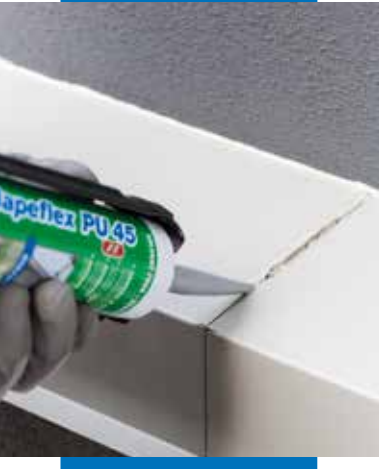
Flexible sealing of construction joints

("Sealants for pedestrian walkways") with performance rating PW-EXT-INT-CC.