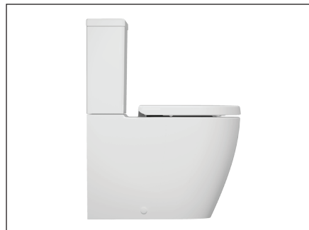
Back entry version of pan pictured