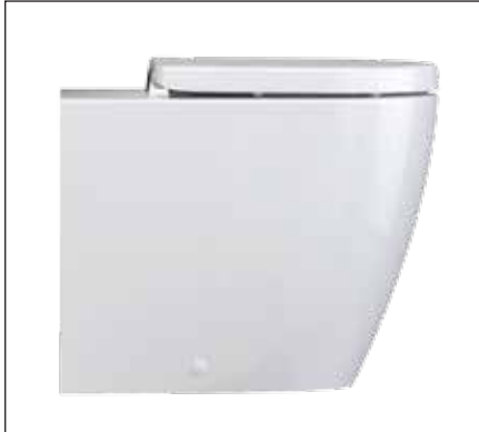
Pictured with Caroma Arc soft close seat

Combining universal design with rimless pan technology, the Urbane Cleanflush™ is a superior flushing system suitable for domestic and commercial applications. Incorporating several patented technologies: Caroma Flow Splitter™, Caroma Flow Balancer™ and Caroma Uni-Orbital™ Connector, the Cleanflush pan is innovative and the next evolution in toilets. The Flow Splitter evenly flows water around the top of the bowl to meet at the Flow Balancer which directs the water powerfully into the sump, reducing the need for brush cleaning. The rimless pan is easy to clean and unlike traditional pan profiles, provides full visibility of any grime build up. Caroma Cleanflush provides a cleaner clean for peace of mind.