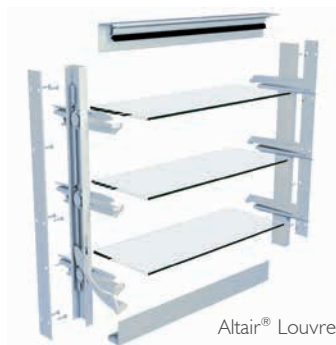
Altair® Louvre Componentry for Commercial Frames.