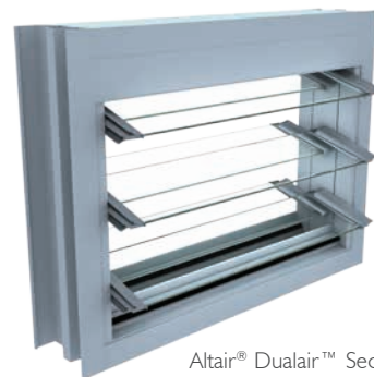
Altair® Dualair™ Secondary Glazed Louvre System.