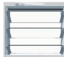
Altair® Powerlouvre™ Window System.