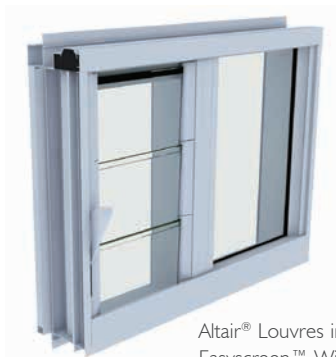
Altair® Louvres in an Easyscreen™ Window System.