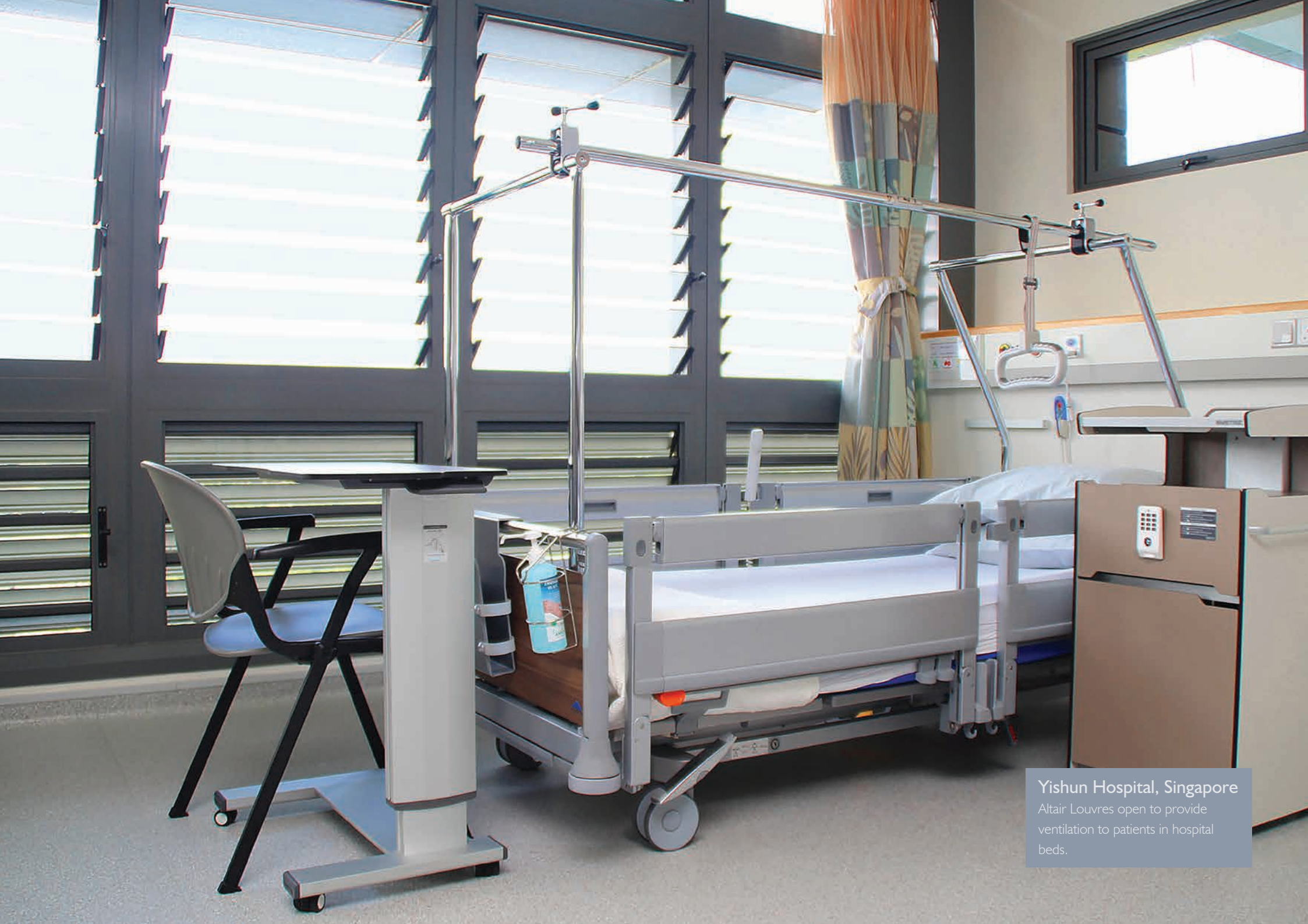
Yishun Hospital, Singapore Altair Louvres open to provide ventilation to patients in hospital beds.