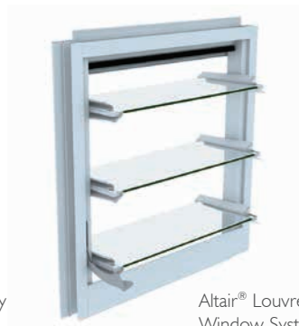
Altair® Louvres in an SL2® Window System.