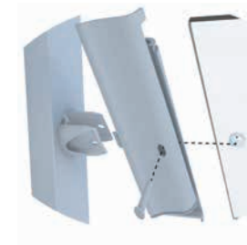
Altair® Louvre Windows with the Stronghold® System.