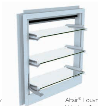
Altair® Louvres in an SL2® Window System.