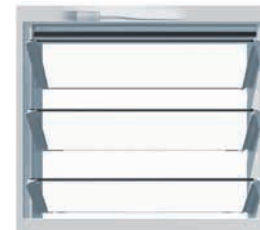
Altair® Powerlouvre™ Window System.