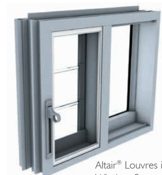
Altair® Louvres in an Innoscreen® Window System.