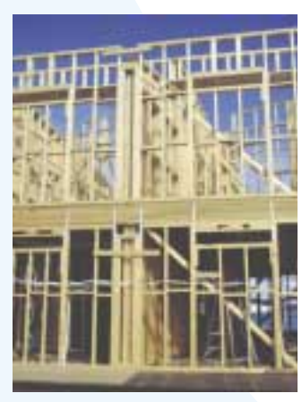
Multi Residential Timber Framed Construction