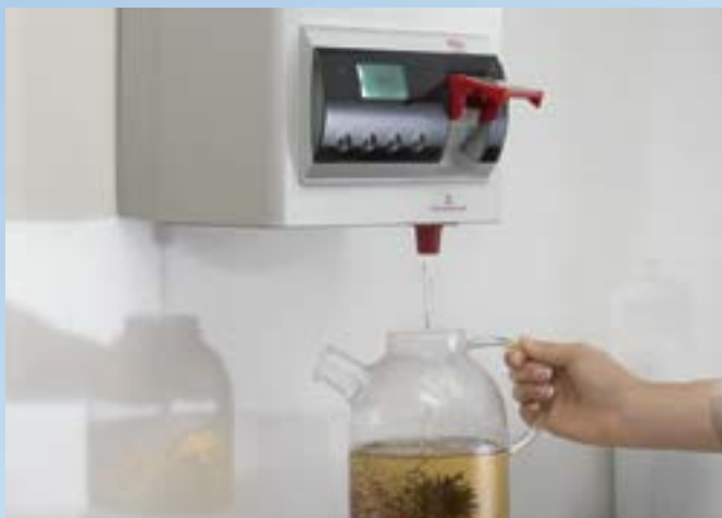
Tap locks ON for filling larger pots.