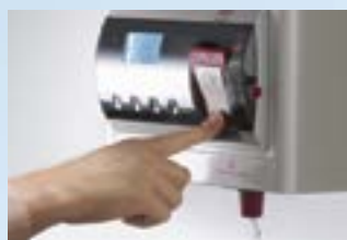
Fingertip control for safe cup filling.