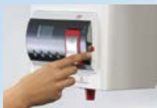
Safety lock prevents accidental use.